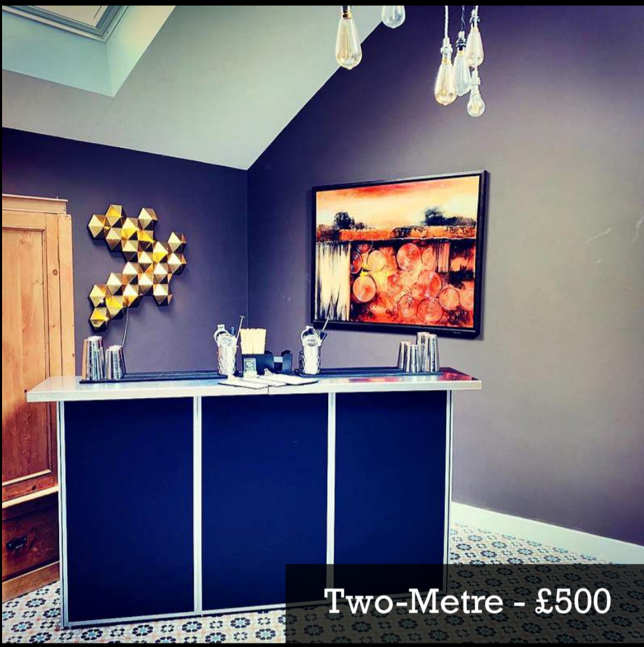
Two-Metre - £500