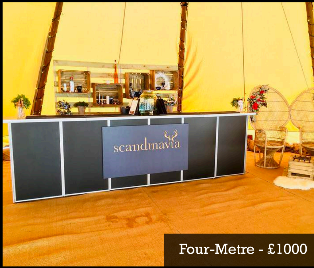
Four-Metre - £1000